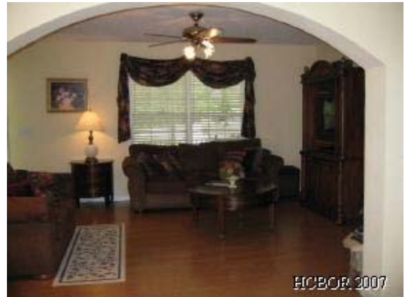
Main house LR