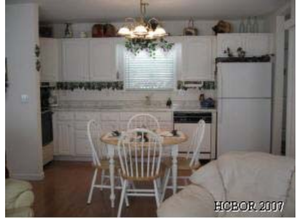
Carriage house - kitchen