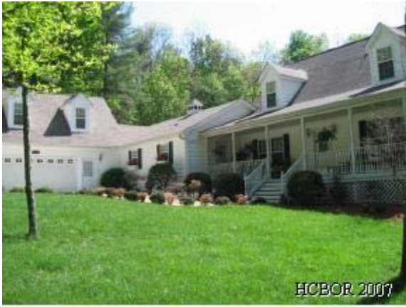
Front of Home