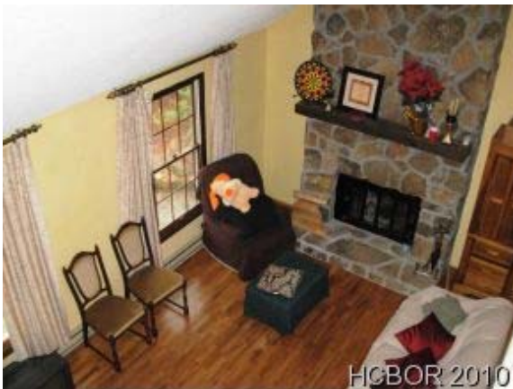
Loft down to Living Room