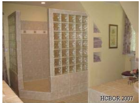
Master Bath - main house

- - - Information herein deemed reliable but not guaranteed. - - -