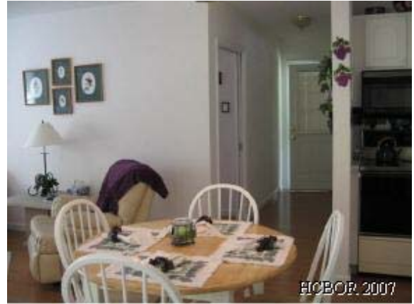
Carriage house DR