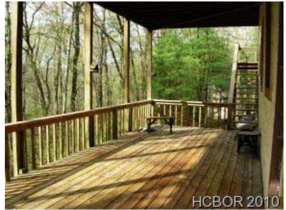
Lower Level Porch