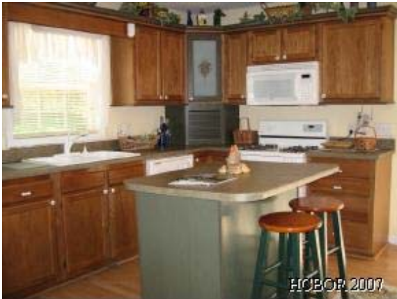
main house - kitchen