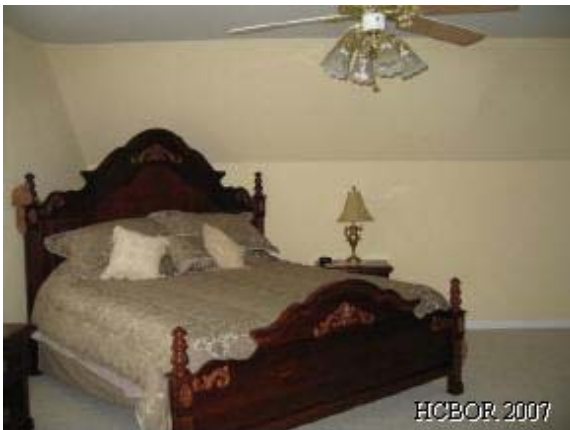
Large MBR - Main house