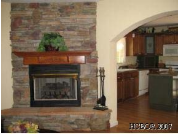
Main house FP/LR