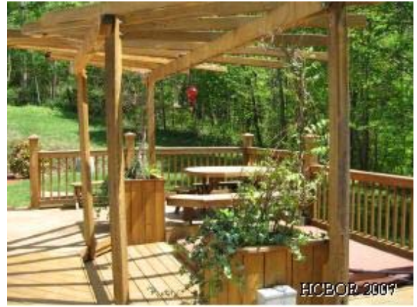
Gazebo and hot tub