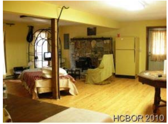
Lower Level Living and Bath